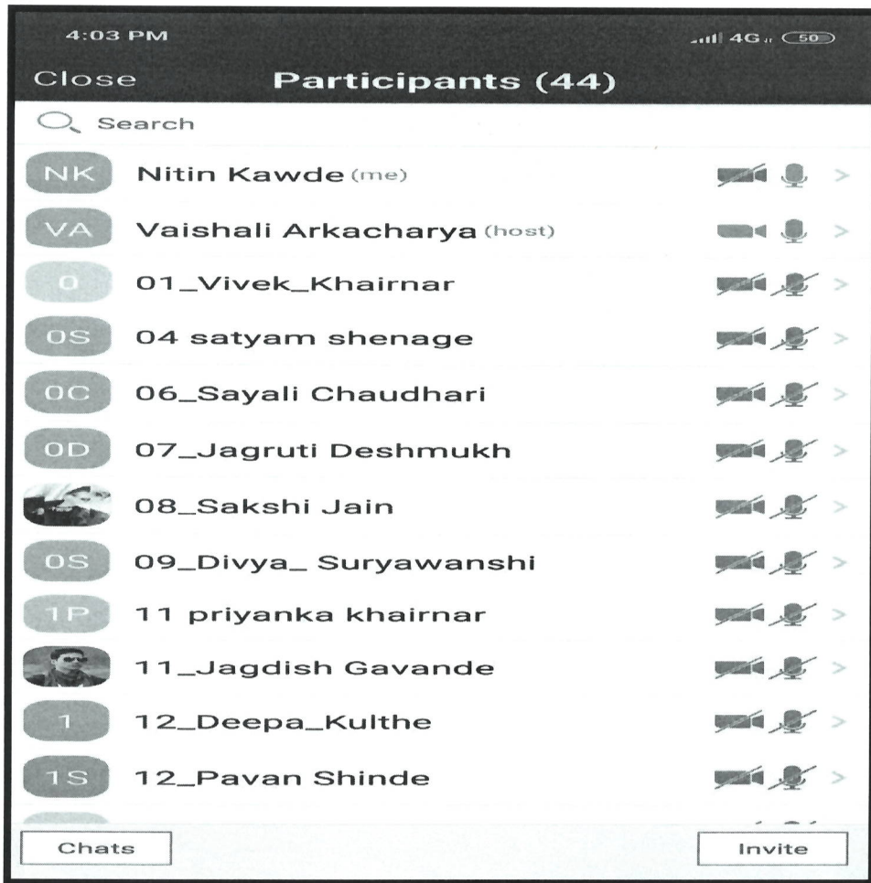
Students of S Y BTech & T Y BTech (IT)